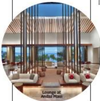
Lounge at Andaz Maui

We landed in Maui last night, so waking up at the Andaz Maui at Wailea Resort (from $419 per night, maui.andaz.hyatt.com ) is amazing. As we dig in to a breakfast of passion fruit, omelets, and blended-to-order juices, we eye the view of terraced infinity pools and the gleaming Pacific beyond.