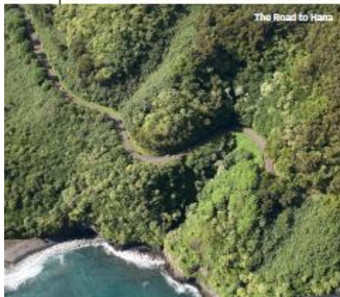
The Road to Hana

Eric's determined to get an early start on the Road to Hana, a 64-mile drive through rain forests and volcanic terrain. Me? I just want to survive as he mans the wheel through 600 hairpin turns and 45-plus one-lane covered bridges. I also want to soak in as much greenery as possible: We hike through bamboo forests at Na'ili'i'i Haele and marvel at the Seussian painted eucalyptus trees