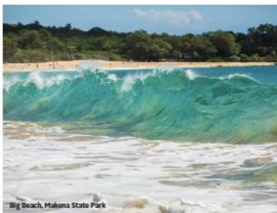
Big Beach, Makena State Park