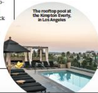
The rooftop pool at the Kimpton Everly, in Los Angeles