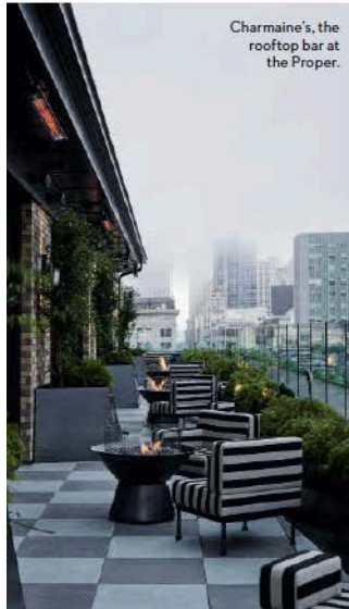
Charmaine's, the rooftop bar at the Proper.