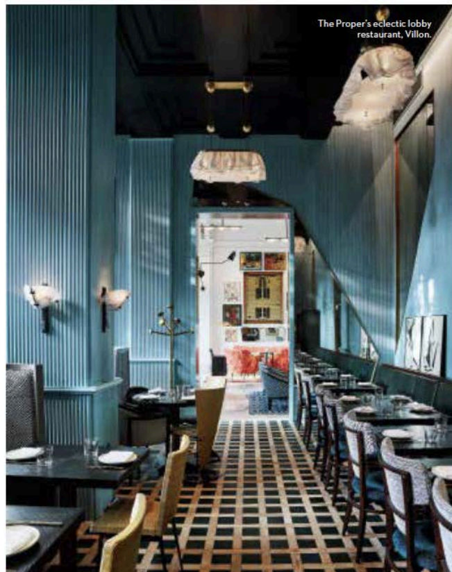
The Proper's eclectic lobby restaurant, Villon.