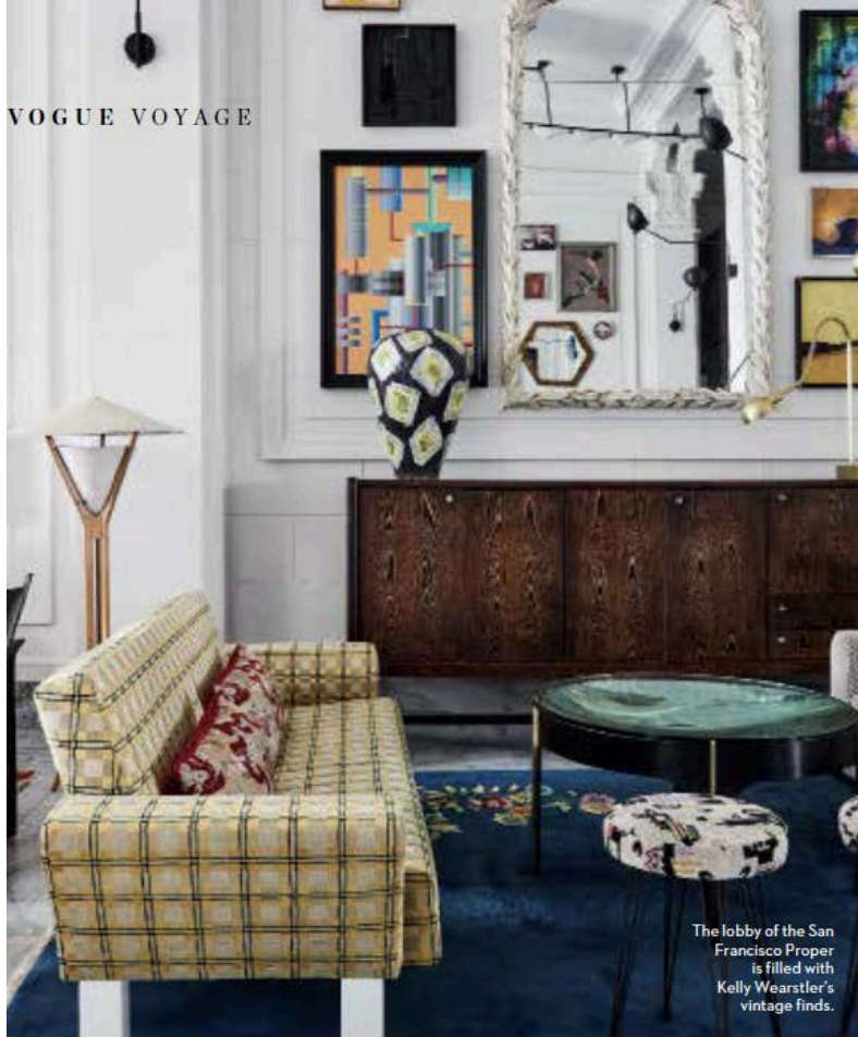
The lobby of the San Francisco Proper is filled with Kelly Wearstler's vintage finds.