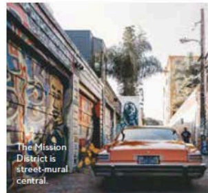
The Mission District is street-mural central.