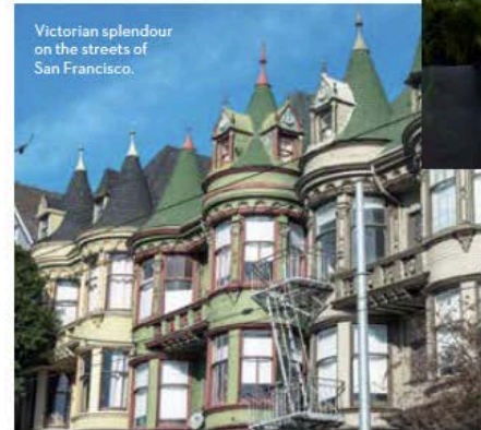
Victorian splendour on the streets of San Francisco.