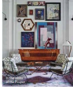
In the lobby of the Proper.