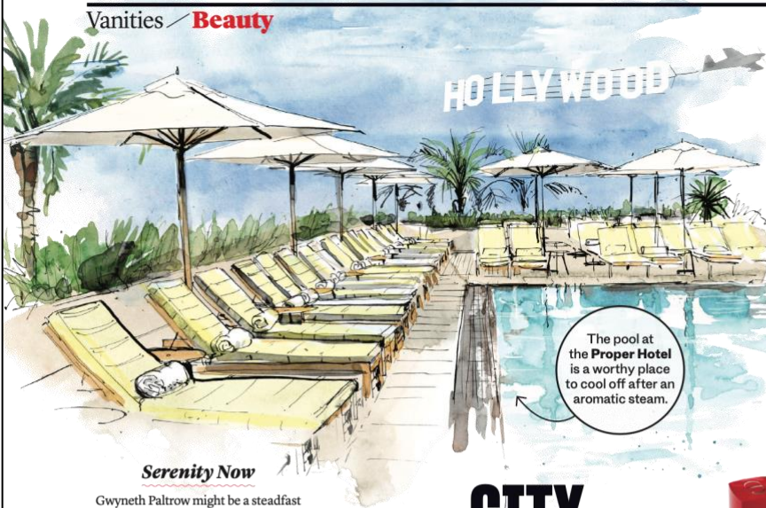
The pool at the Proper Hotel is a worthy place to cool off after an aromatic steam.