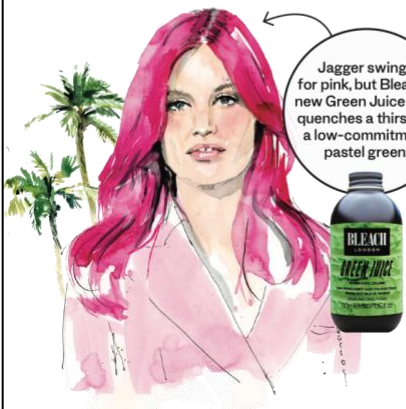
Jagger swings for pink, but Bleach's new Green Juice [$9] quenches a thirst for a low-commitment pastel green.